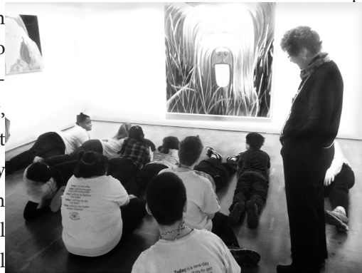
We love admiring art at the Milwaukee Art Museum, as much as we love creating our masterpieces.

I LOVE summer! I get to do all sorts of fun stuff like work in my garden and go for bike rides. But what really gets me excited is thinking about all the new and fun things we'll be doing at school in the fall. Just at the end of this school year, our new iPads arrived! I can't wait to start using them in school and watch how excited the kids will be. Some of our students already have iPads and have been using them in school. They are so interested and engaged in learning, that it's hard to get them to put away their tablets. In the fall of 2014, all of our students will have access to a tablet! That's exciting!