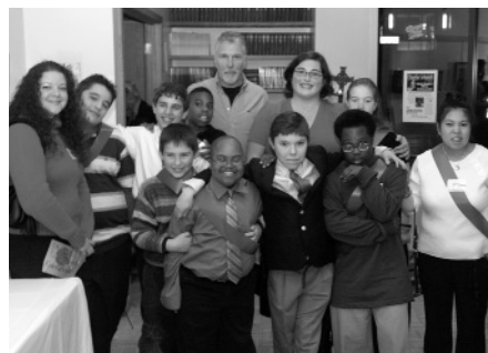
Another successful ColettaScope for St. Coletta Day School, raising over $10,000.

"It was a good experience for me and I learned things while helping out."